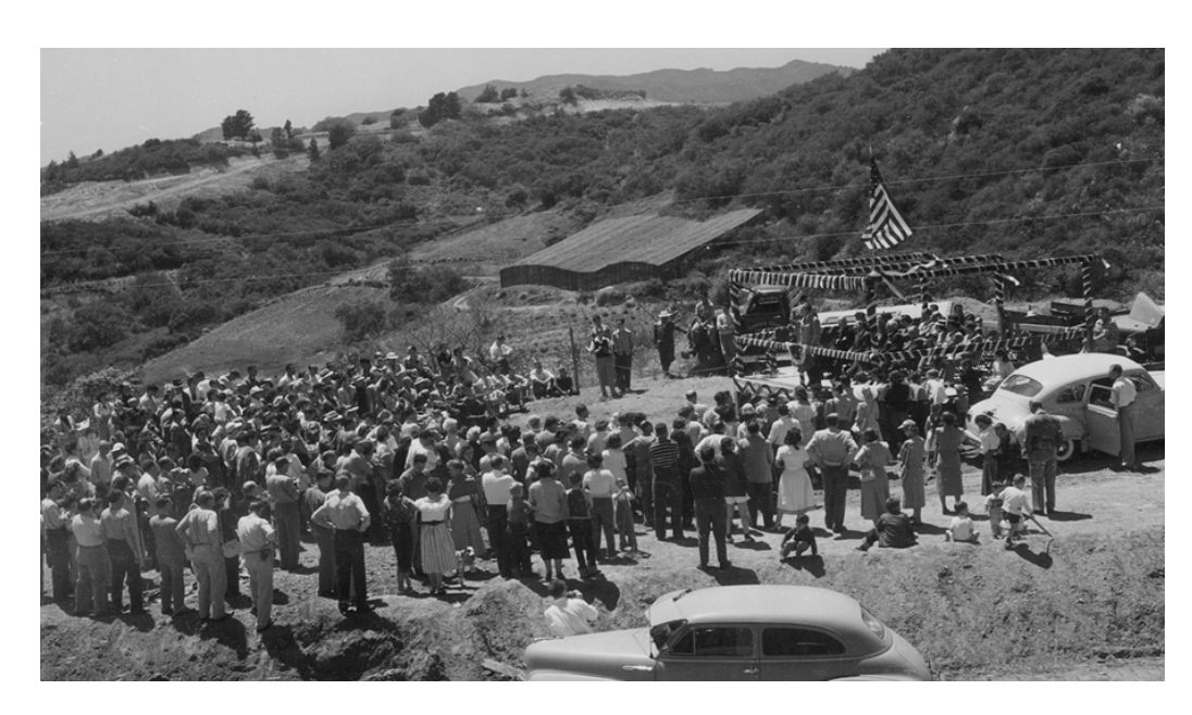
Crestwood Hills groundbreaking with a plant nursery in the background.

after the Association deemed the plans too modern. They returned with fifteen additional plans for modestly priced houses designed with a simple exposed structure and materials. The architects presented a booklet, "Mutual Plans," consisting of twenty-eight house designs, to the Association in 1948. The Association then began a series of meetings to determine which houses it would select as models for the development. Eventually, eight of the plans were constructed.