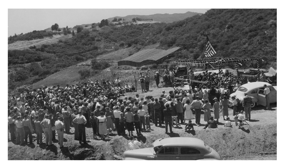
Crestwood Hills groundbreaking with a plant nursery in the background.

after the Association deemed the plans too modern. They returned with fifteen additional plans for modestly priced houses designed with a simple exposed structure and materials. The architects presented a booklet, "Mutual Plans," consisting of twenty-eight house designs, to the Association in 1948. The Association then began a series of meetings to determine which houses it would select as models for the development. Eventually, eight of the plans were constructed.