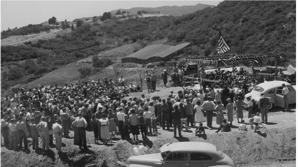
Crestwood Hills groundbreaking with a plant nursery in the background.

after the Association deemed the plans too modern. They returned with fifteen additional plans for modestly priced houses designed with a simple exposed structure and materials. The architects presented a booklet, "Mutual Plans," consisting of twenty-eight house designs, to the Association in 1948. The Association then began a series of meetings to determine which houses it would select as models for the development. Eventually, eight of the plans were constructed.